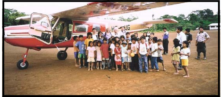
Excited children surround medical volunteers on a landing strip in the deep Amazon.

remote area have arranged transportation for some of our doctors to fly in, screen patients and then transport selected patients to Macas for surgery. We will also be donating an ultrasound machine for local use. Health care is so poor in these regions that almost 100% of the population has malaria once a year. Four people out of the 30 families living in Tukupi died of Hepatitis B complications last year.